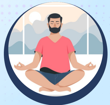
LIFESTYLE & WELLNESS